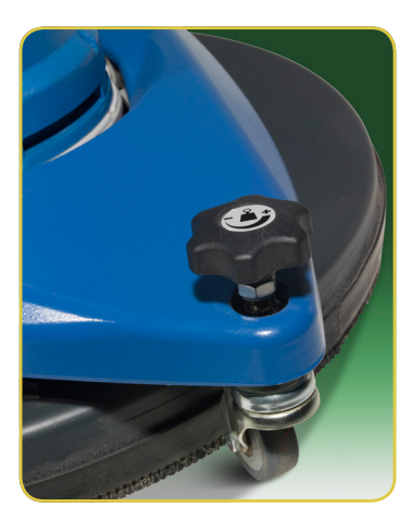
Simple load adjustment