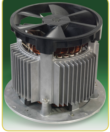
Hi-Cool heavy duty motor technology