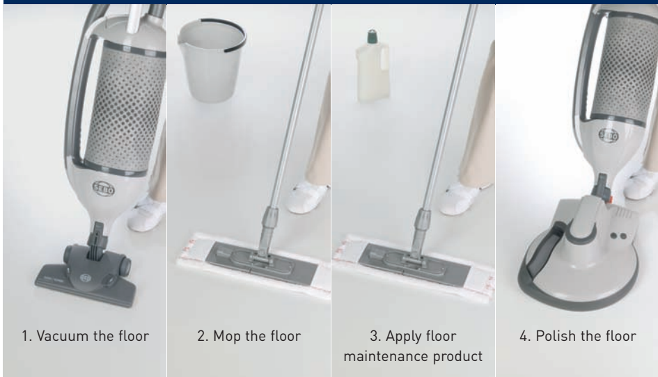
1. Vacuum the floor